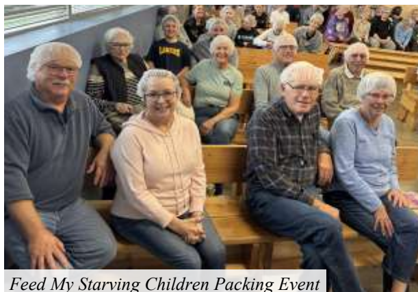
Feed My Starving Children Packing Event