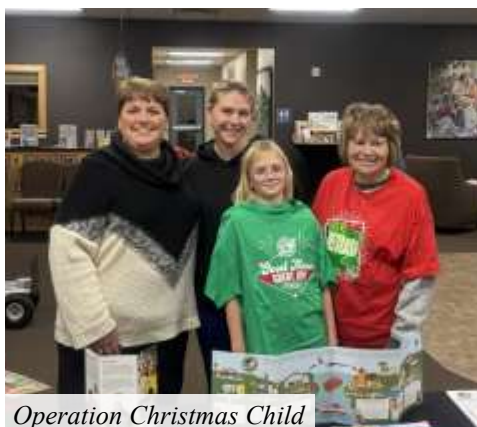
Operation Christmas Child