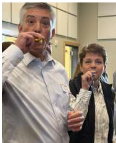
Fat Sunday Kazoos

XIV. Closing Prayer: Closing Prayer — Lord's Prayer all together.