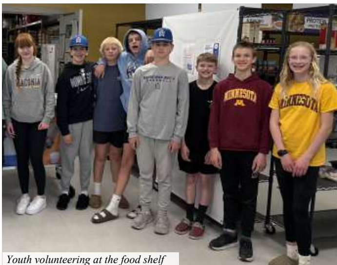
Youth volunteering at the food shelf