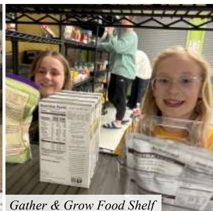
Gather & Grow Food Shelf