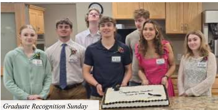
Graduate Recognition Sunday

near New Germany, and we are blessed with three adult children, a daughter-in-law, and three grandchildren. Our home is also shared with two dogs and a cat, who keep life lively. Professionally, I serve as an Area Manager for a company that partners with veterinary clinics, where I help support the clinic leaders at nine locations. I also bring prior board experience, having served multiple terms on the Board of Directors at Christ Community Lutheran School while my children were students there. I would be honored to serve Peace Lutheran Church in this role, and support the continued growth and well-being of our congregation.