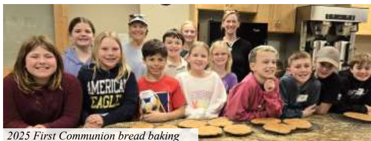
2025 First Communion bread baking