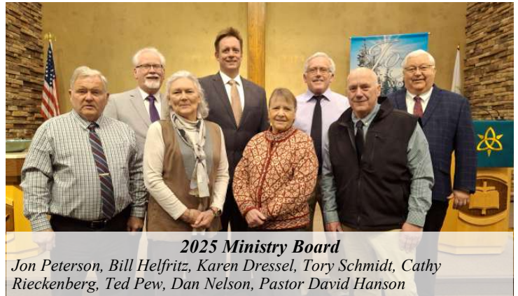
2025 Ministry Board