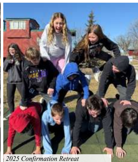
2025 Confirmation Retreat