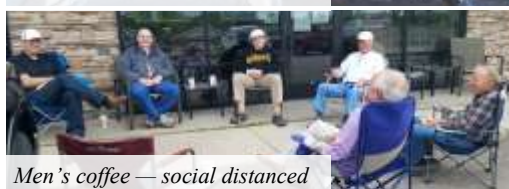
Men's coffee — social distanced