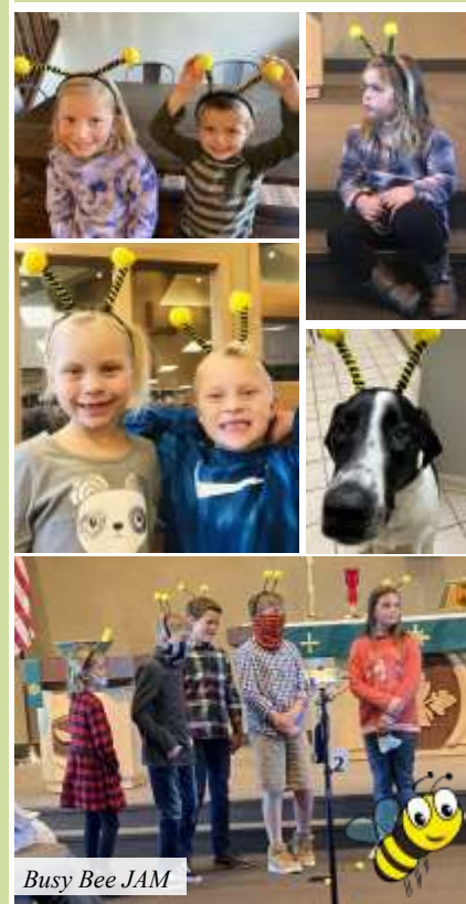
Busy Bee JAM

You do not need to have ANY technical knowledge to be part of the technology team. We are always looking for new ideas that can better benefit our Church. If you have a passion about social media, live-streaming, hardware/software, etc., we would love to have you a part of our team!