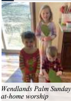
Wendlands Palm Sunday at-home worship