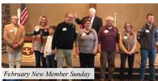
February New Member Sunday