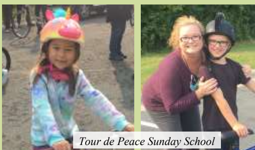
Tour de Peace Sunday School

Christian Education is always looking for and open to new members. We have a small committee that needs help creating and preparing for the growing church needs and their members' desires for ongoing educational opportunities. If you have a heart and passion for this, please join us. During this crazy time, having a place for our members to go and learn from different sources is critical (young and old). We are living in unprecedented times, and God is the only thing that will be able to get us through to the other side. Keep your faith and do not fear....God says this 365 times in His word, we should do our best to live this out as Christians, it is what God asks us to do. God