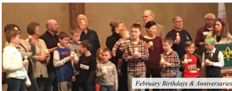
February Birthdays & Anniversaries