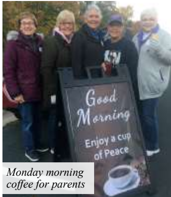
Monday morning coffee for parents

coffee to the parents waiting in the long line to drop-off their children at school. The line-up started at 7:30ish and wrapped around the corner and all the way down to Peace and County road 20. Beginning September 28 th , we set up on the corner of Kristi Lane and Robert Street. We served each Monday through October. October 19 th and 26 th , the cups included a sleeve advertising Peace's Trunk and Treat for Halloween (thank you Sandy!)