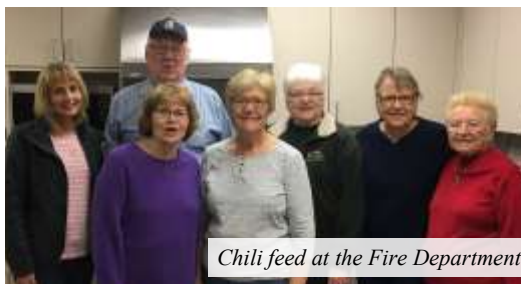
Chili feed at the Fire Department