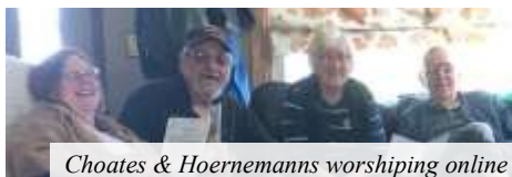
Choates & Hoernemanns worshipping online