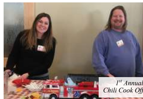
1 st Annual Chili Cook Off

Because of Covid-19, virtually all of our activities were cancelled during 2020. We are anxiously waiting to be able to resume some normalcy in the